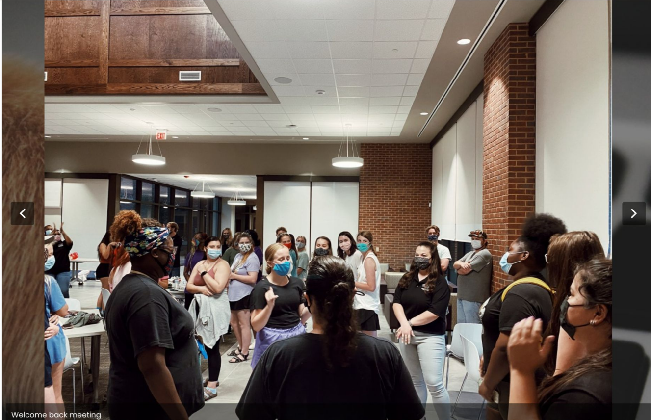
Welcome back meeting